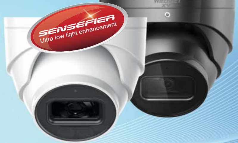
XVI-50IRBTR2 / XVI-50IRBTR2-B 5MP IR Eyeball Camera