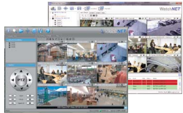
FREE Multisite VMS software Download from www.watchnetinc.com