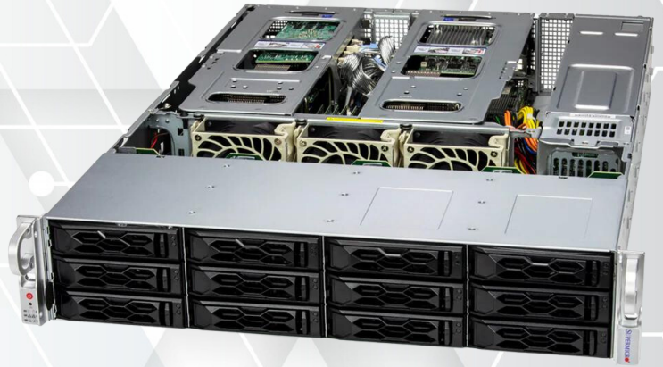
HAWK Pro 256