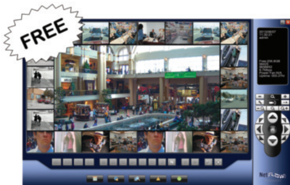
Professional 64 CH NetFLOW LT FREE Software included