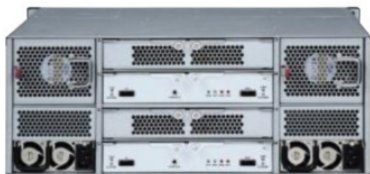
IPVS-24R / IPVS-24DR