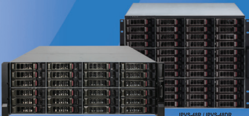
IPVS-24R / IPVS-24DR