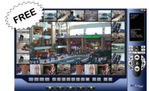
Professional 64 CH NetFLOW LT FREE Software included