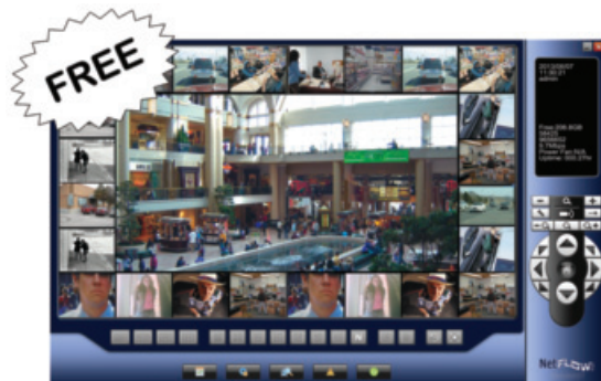
Professional 64 CH NetFLOW LT FREE Software included