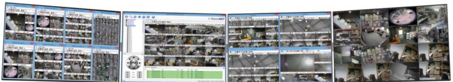
Virtual Matrix Terminal / Multiple Event Popup