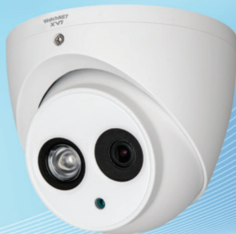
XVI-80IRBT 4K HD CVI IR Turret Camera

XVI ENHANCED CVI MegaPixel over UTP/Coax