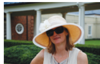
2. WDR On