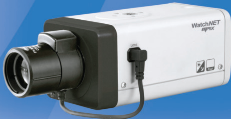
MPIX 21SBC *