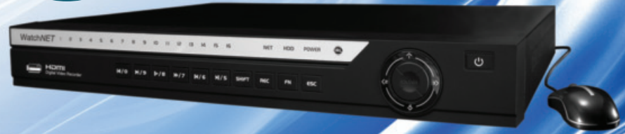
PNT-0880AI / PNT-1680AI