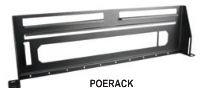
POERACK Rack Mount for POESW8 Holds up to two POESW8 per mount