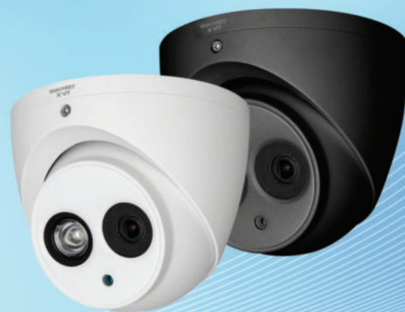
XVI-50IRBT / XVI-50IRBT-B 5MP IR Turret Camera