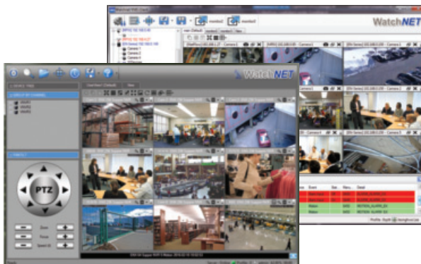
FREE Multisite VMS software included