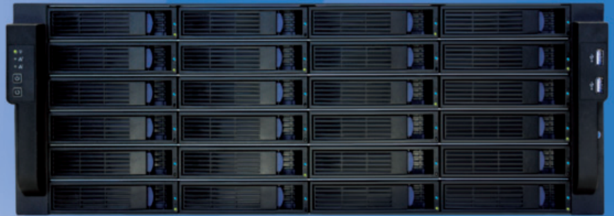
ESR - 24B