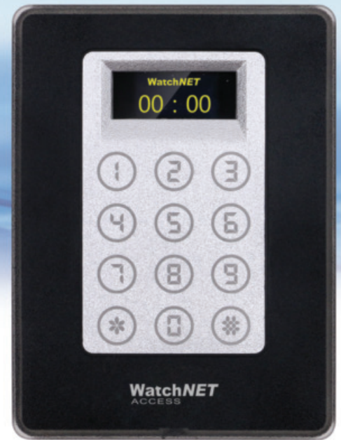
WAC-1D2TH-MICRO (Built-in HID Proximity Reader)