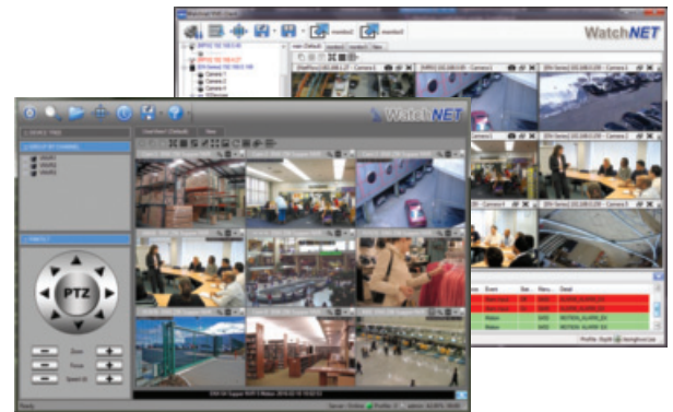
FREE Multisite VMS software Download from www.watchnetinc.com