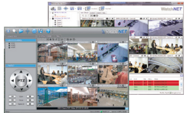
FREE Multisite VMS software Download from www.watchnetinc.com