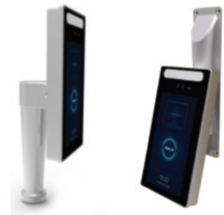
WAA-428P Pole Mount