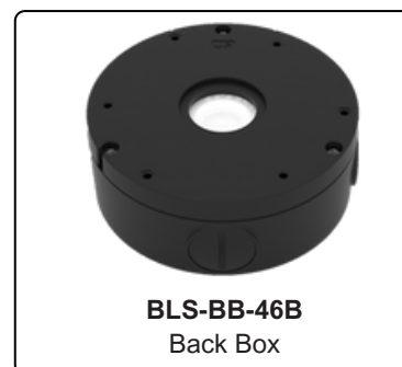
BLS-BB-46B Back Box