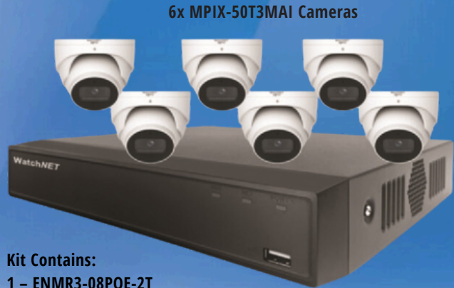
6x MPIX-50T3MAI Cameras