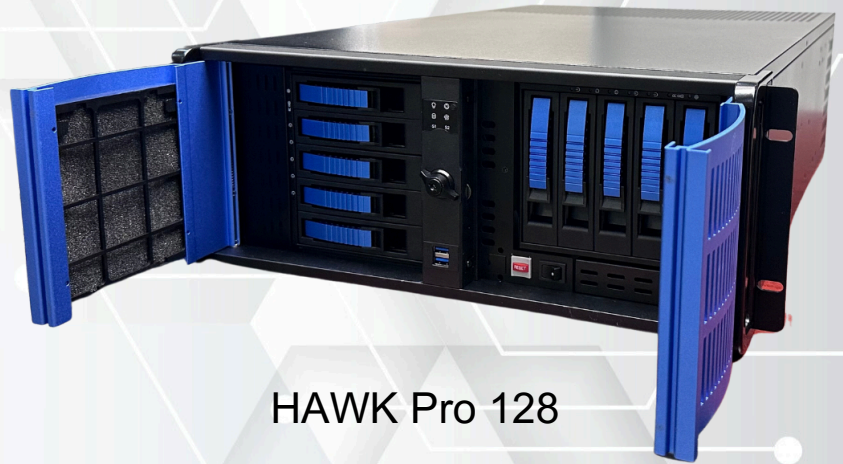
HAWK Pro 128