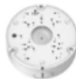
BLS-BB-BUL2 Junction Box