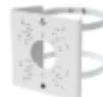
BLS-POLE-27 Pole Mount